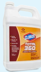
4/128 oz. Gallon UPC: 31650