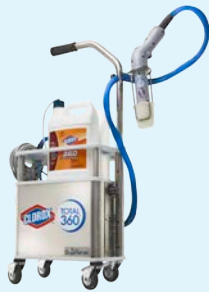
1 Unit UPC: 60010